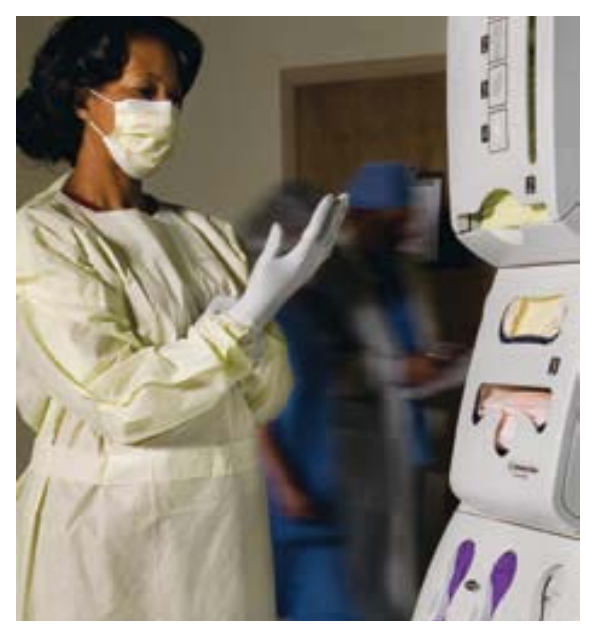
Improving PPE selection and use compliance relies on having a systematic process in place which enables the HCW to do the right thing.