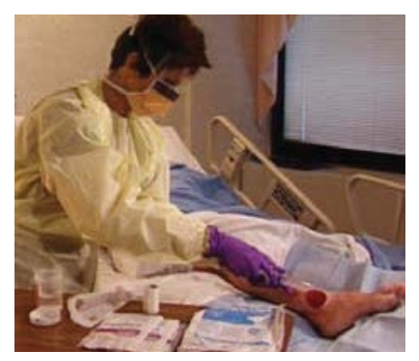
The most important consideration when choosing protective apparel is its functionality. ^{7}\,

Consider isolation gowns as an example. It is impossible to tell which gown would provide the most protection based solely on visual or tactile inspection. There are different types and characteristics of barrier fabrics and it is important to understand the barrier protection inherent in the product being purchased and provided to the HCW. Another important point worth noting is that contrary to surgical gowns, where the majority of exposures to blood and body fluid are frontal, gowns used for cover and isolation applications need to be protective not only in the front but also in the back due to the more unpredictable types of potential contact with blood, body fluids, and OPIM associated with general patient care. Additionally, isolation gowns need to protect the patient from microbial contamination which can be present on all sides of the HCW's body and work clothing.