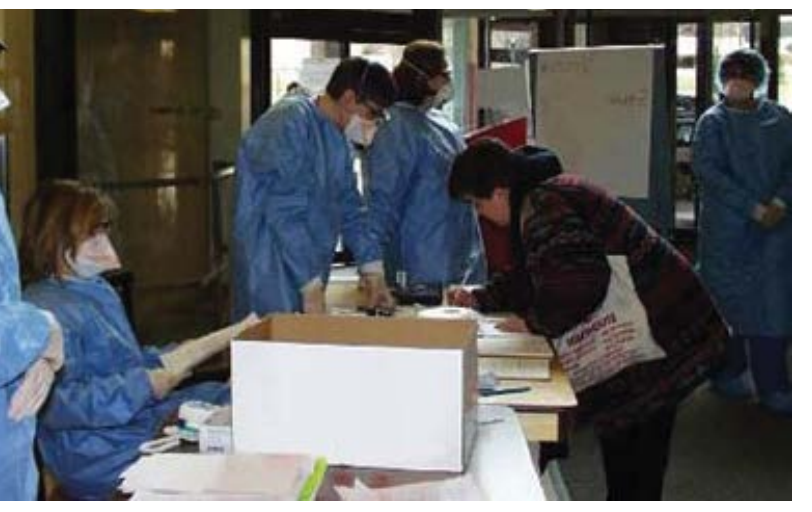
The SARS outbreak in Toronto illustrated the critical importance of PPE use in healthcare facilities.

Syndrome (SARS) outbreak in Toronto to appreciate that fact.<sup>34</sup> PPE, when appropriately selected and used, does protect both the patient and the HCW. After gloves, the most commonly used PPE are gowns. As part of Standard Precautions, isolation gowns are to be worn to protect the HCWs' arms and exposed body areas during procedures and patient-care activities when anticipating contact with: clothing, blood, body fluids, secretions and excretions.<sup>1</sup> Contact Precautions, a component of the Transmission-Based Precautions, recommends routine use of gowns along with gloves for all patients infected with multi-drug resistant organisms (MDROs) and for patients who have been previously identified as being