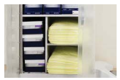
Ensuring a consistent supply of PPE is critical to overcoming potential barriers to selection and use.

for new personnel must be extensive, consistent and pervasive. One telling statistic may be the percentage of orientation time allotted to patient safety and infection prevention education. Safety and improved patient outcomes, including healthcare-associated infection reduction, can be enhanced by improving or creating organizational characteristics within the board rooms and the Chief-suites as well as on patient care units.